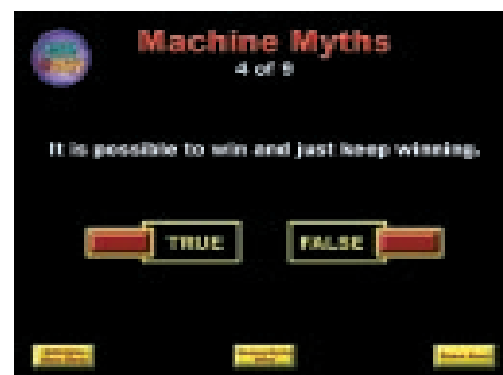
All screen shots from safe@play TM Customer Assistance Software

GAME PLANIT is a leader in finding workable solutions to gambling problems, and is committed to helping the gambling industry implement these solutions.